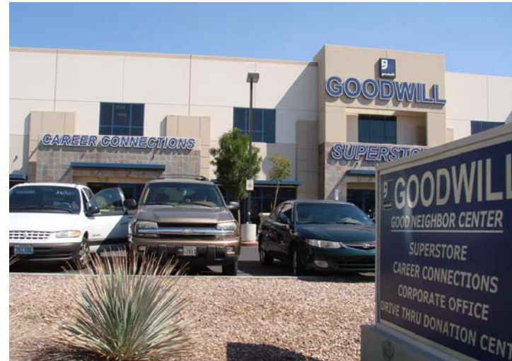
Goodwill of Southern Nevada ended 2009 with 8 retail stores and 29 attended donation centers.