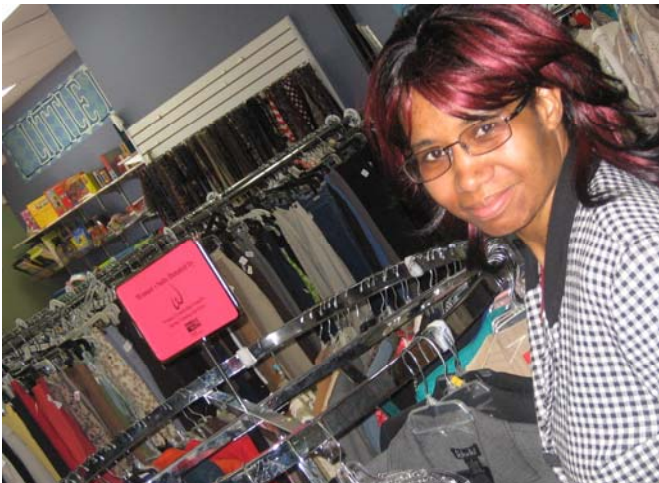
March 2009 & Nov. 2009: Women's Leadership Council's Spring & Fall Suit drives collect thousands of pieces of professional clothing for Goodwill of Southern Nevada. Because of the donations from the two drives, $18K of Goodwill Gift Cards are distributed to clients at Career Connections in need of clothes for new jobs &/or job interviews.