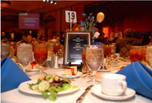
March 2009: Community Recognition Luncheon honors clients and community partners.